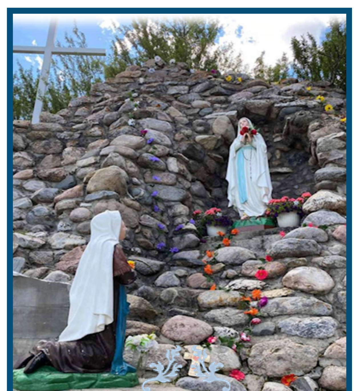
The Eucharist bathes the tormented soul in light and love. Then the soul appreciates these words, 'Come all you who are sick, I will restore your health.' St. Bernadette Soubirous