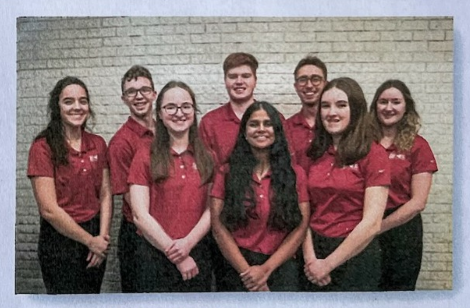
NET 2024 Traveling team

Saturday, May 4th Holy Cross Parish 10:00 am to 3:00 pm Grades 6 to 12 All youth from the Archdiocese are welcome